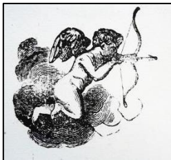
Illustration from the Library's Nozze collection