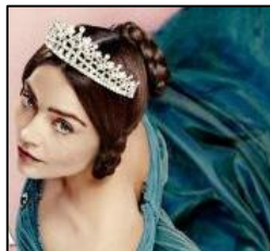
Jenna Coleman in Victoria