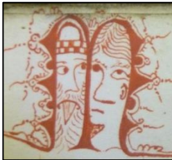
Image: Medieval marginalia of gothic grotesques in a recently discovered medieval manuscript charting the movement of stars

The Fair opens to the public from 6th to 9th October.