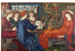
Sir Edward Coley Burne-Jones Laus Veneris 1873-1878 Laing Art Gallery, Newcastle upon Tyne