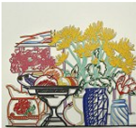
Frieze 2017

Many of their sparkling letters are published for the first time and shed new light on the future leader's early thinking and career.